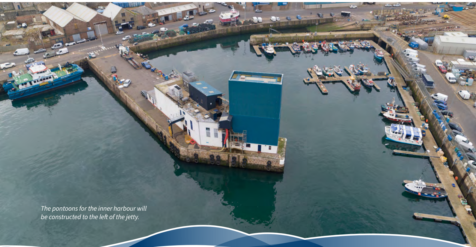
The pontoons for the inner harbour will be constructed to the left of the jetty.

"The opportunities are huge, and the Board and staff of PPA are focused on ensuring the Port is in the best position possible to support growth, from facilities to services."